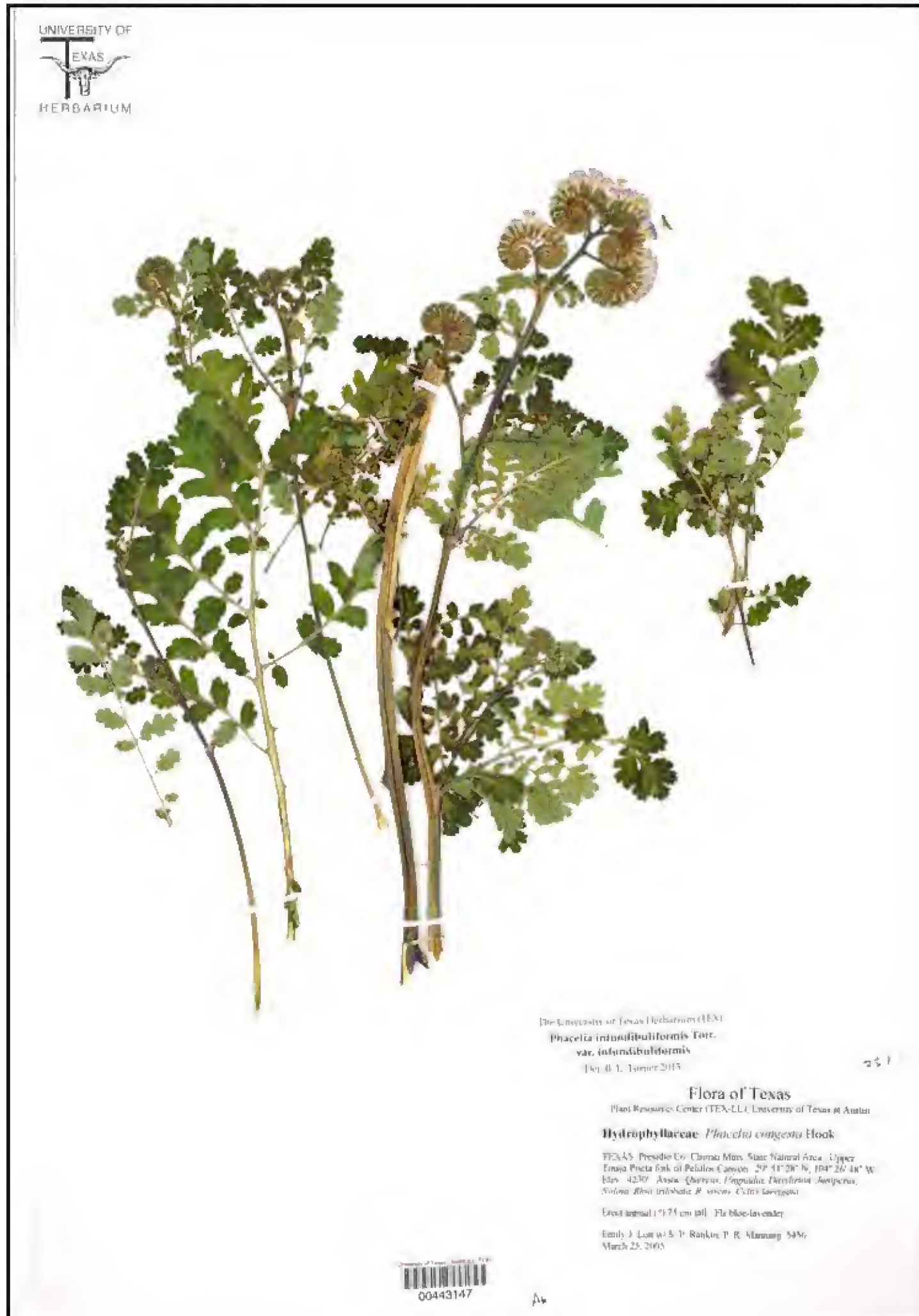
Fig. 1. Phacelia infundibuliformis var. infundibuliformis